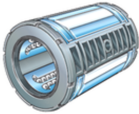
KS25-PP Bearing 2D drawings and 3D CAD models